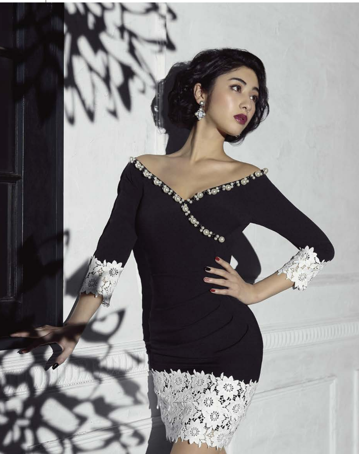
COLLECTION 03 | NUMBER : AN-OK1309 | COLOR : Black / White | SIZE : S / M | PRICE : ¥24,800 (税別)

What is your substance, whereof are you made, That millions of strange shadows on you tend? Since every one, hath every one, one shade, And you but one, can every shadow lend: Describe Adonis and the counterfeit, Is poorly imitated after you, On Helen's cheek all art of beauty set, And you in Grecian tires are painted new: Speak of the spring, and foison of the year, The one doth shadow of your beauty show, The other as your bounty doth appear, And you in every blessed shape we know. In all external grace you have some part, But you like none, none you for constant heart.